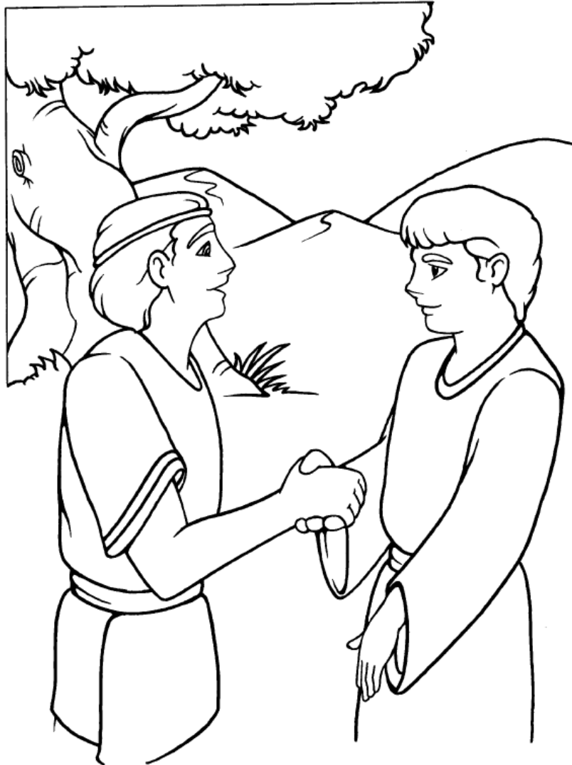
Esau Sells His Birthright to Jacob Genesis 25:19-34

Copyright © CalvaryCurriculum.com Used by Permission